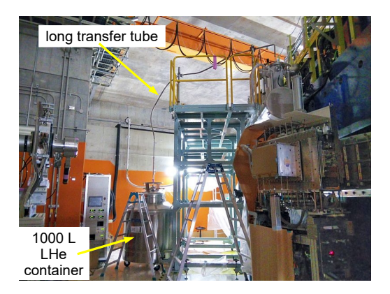
Fig. 2. Liquid helium transfer to the lower coil using the 1000 L container with the long transfer tube.

Fig. 1. The tube for liquid nitrogen and the recovery port for gaseous helium. (a) photo in 2014. There was no recovery port near the magnet. (b) photo in 2022.