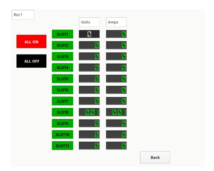
Fig. 2. A new pop-up panel appears by clicking "Detail" button on the main control panel.

order to avoid the main control panel being too busy with too many buttons and voltage/current displays, a "Detail" button is implemented on the bottom left corner of the panel. A new pop-up panel, as shown in Fig. 2, appears on the screen by clicking the Detail button.