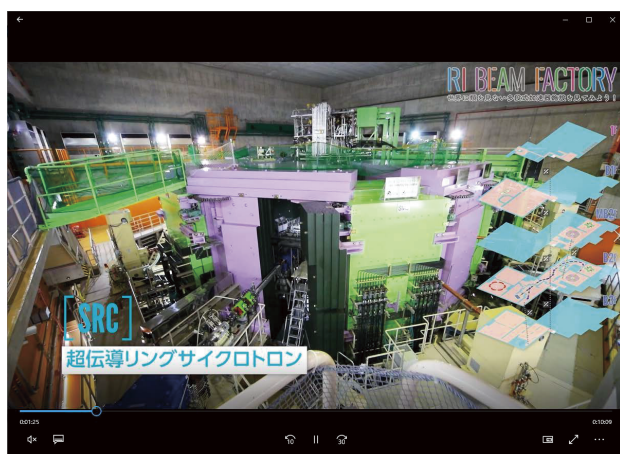
Fig. 2. Movie for the RIBF virtual tour.

For the virtual accelerator tour, RIBF movie taken along to the accelerator and downstream beamline was shared to visitors. Figure 2 shows the movie shared for the RIBF tour. SRC, BigRIPS, and SAMURAI were contained in the movie. Researchers described about RIBF accelerators and experimental instruments with