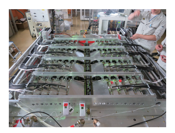
Fig. 1. GET electronics mounted on SPiRIT TPC. Each AsAd board is shielded with Al cover.

At the end of summer 2015, 48 AsAd boards for the amplification and digitization of signal were mounted on the TPC as shown in the Picture 1. During the installation of AsAd boards, the performance of the system was carefully checked. After we mounted half of the electronic components, we found that there were large gain deviations between different pads. This was a serious problem for the TPC, as TPC needs a uniform gain so that it can achieve good tracking and proper triggering. The reason for this was the instability in the power that was provided to the AGET ASIC chips on the readout board, which can be improved by changing the components on the AsAd board. After this modification, we mounted all the boards on the TPC again and checked the uniformity of gain by pulsing the ground wire, which generates a potential around the amplification region. As shown in Fig. 2, the uniformity of the gain is good enough for the reconstruction of charged particle trajectories.