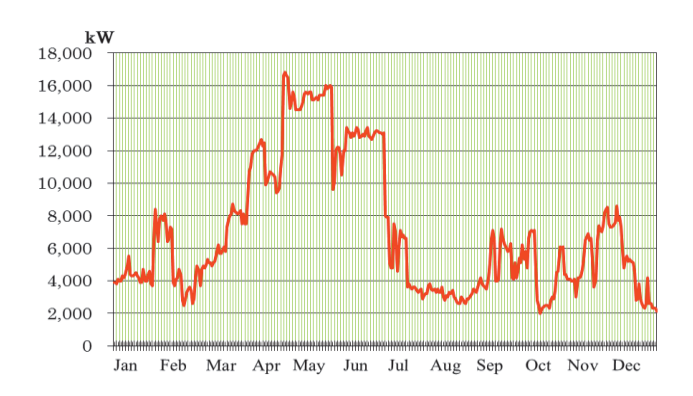
Fig.2 Hourly electrical power consumption of RNC in 2013.