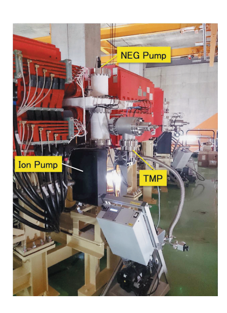
Fig. 2. Vacuum pump combination using TMP, ion pump, and NEG pump.

Next, we installed vacuum pumps and vacuum