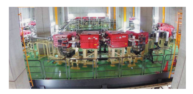
Fig. 1. Picture of R3 at the beginning of July 2013.

The Rare-RI Ring (R3) was constructed smoothly<sup>1)</sup>, and the installation of the magnets and power supplies were completed by the end of March 2013. Subsequently, we tested a cooling water conduction of the magnets and prepared the interlock system for the magnets in order to perform the excitation tests of the magnets. The excitation test was successfully completed at the beginning of July 2013. Subsequently, we performed the precise magnet alignment by using a laser tracker. All the magnets were aligned to the design value by less than 0.1 mm. Figure 1 shows the picture of R3 at the beginning of July 2013.