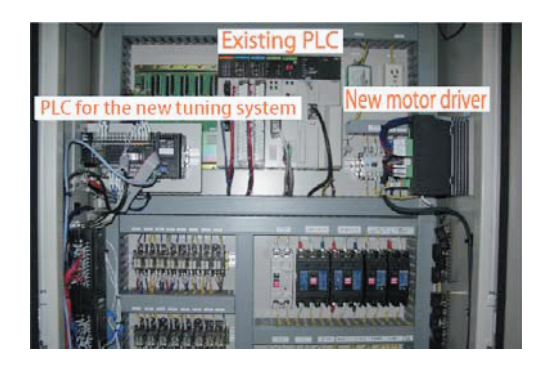
Fig. 2. Control unit of the new tuning system built in the existing RF control system for RILAC cavity 5.

The old tuning system used a geared print motor, which was a DC motor whose rotation speed could not be controllable accurately. By fabricating a mounting plate and driveshaft coupling, the motor was replaced by a new stepping motor. The stepping motor is controlled by a programmable logic controller (PLC) with the principle of proportional speed control feedback based on the phase difference data. The maximum moving speed, feedback gain, and neutral zone can be accurately set locally and remotely.